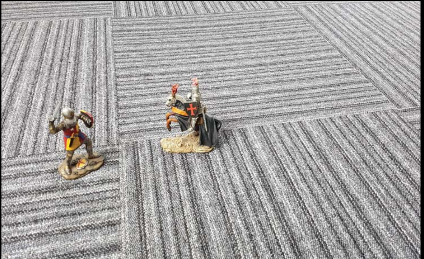
Bellini Lines 7872